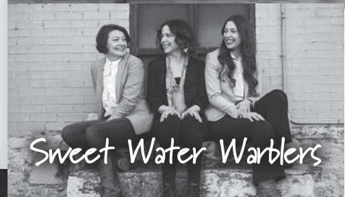
Sweet Water Warblers