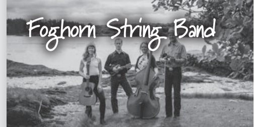
Foghorn String Band